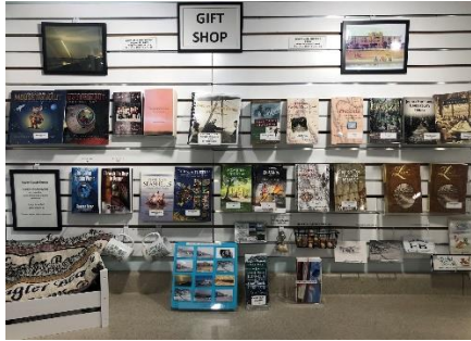
Books & much more