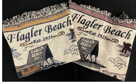
Flagler Beach Throws

Two sizes (large $45 and small $35), two styles, and two colors to choose