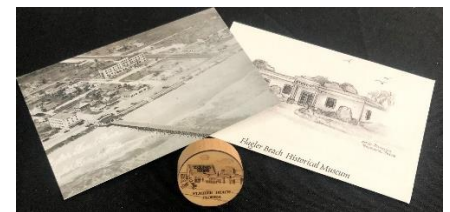
Post Cards & Bottlestoppers

Stop by the Museum for fun, Flagler Beach history related gifts!