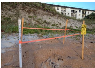
Sea Turtle Nest Site